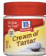
Cream of Tartar